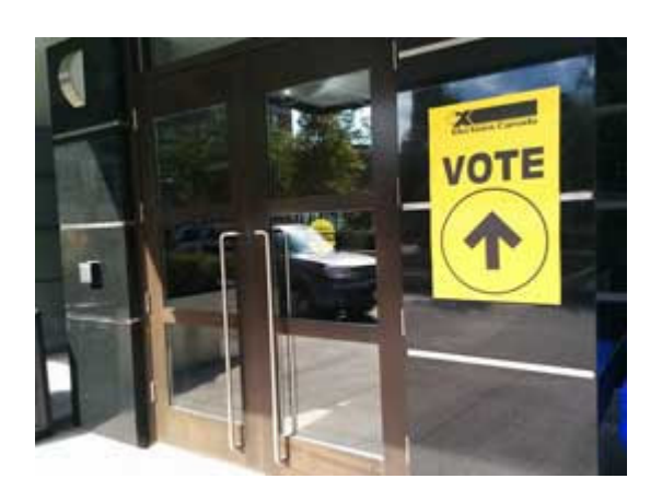
Lock in your vote at an advanced poll this weekend. Polls are open Sept 10-13 from 9am – 9pm.