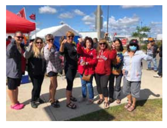
On day 42 of the De Havilland strike, Unifor members gathered for a Labour Day solidarity picnic at the Downsview plant picket line.