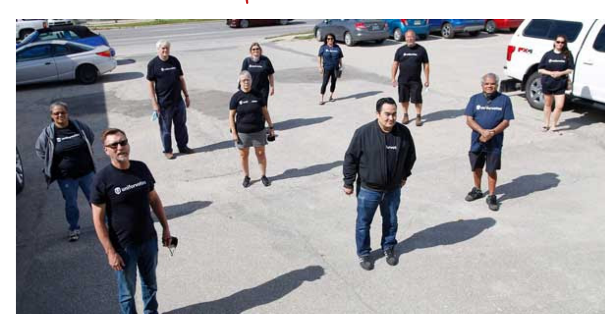
On Labour Day, Unifor members mobilized in communities across the country to volunteer for worker-friendly candidates.